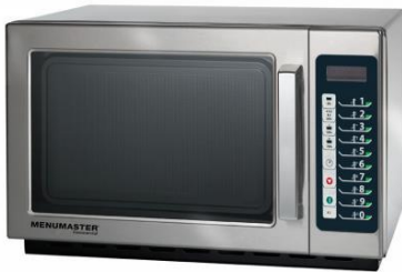
Model RCS511TS shown